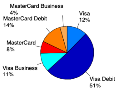
Current Month Sales